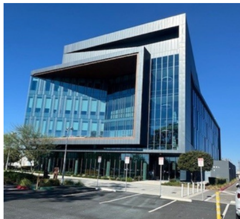
Lundquist MRL Building

There will be signs outside the building to guide you to the MRL.